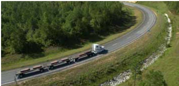
Figure 1. NCAT test track

The primary objective of this study was to recalibrate the asphalt layer coefficient based on current paving materials and construction using data collected at the NCAT Test Track accelerated pavement testing facility (Figure 1).